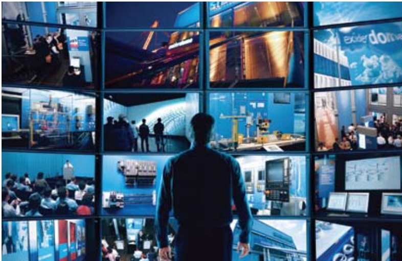
ENGINEERING MARVEL: Siemens Canada Limited brought its “exiderdome,” a two-storey exhibit made of 55 containers, to the Global Petroleum Show in Calgary in June. The exhibit showcased 130,000 products, services and systems offered by the multinational company